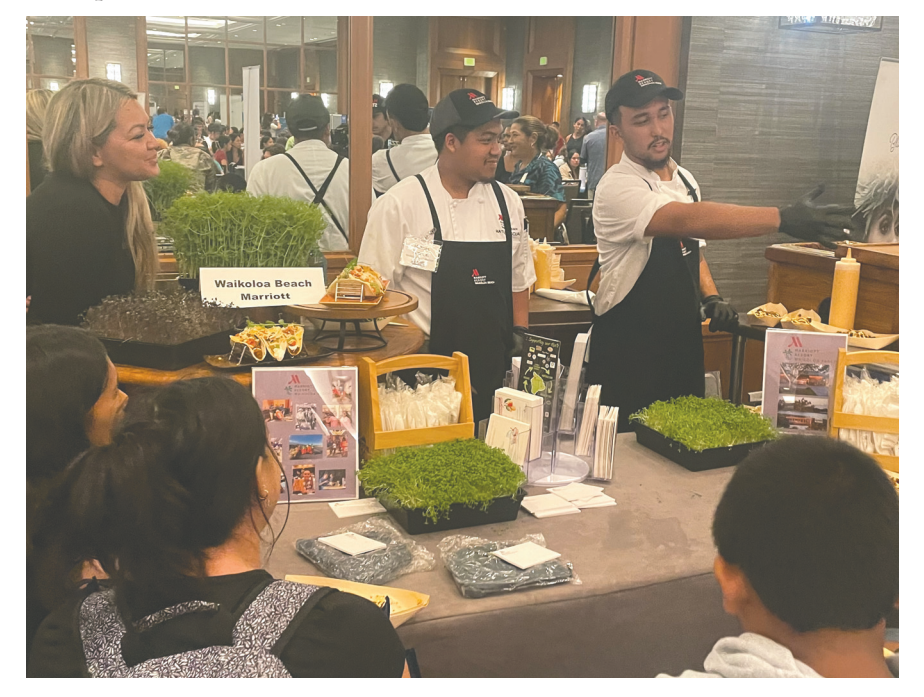
The Waikoloa Beach Marriott staff spoke about the culinary industry.

tive than typical career fairs due in part to the "speed-dating" style that allows participants to uncover more opportunities. Businesses also benefit from dedicated time with participants by sharing career paths that lead to economic self-suffi-ciency here in our islands. By exposing students to high-quality careers with a clear progression plan well before graduation, we are helping them understand the requirements and experience needed to begin their path to success.