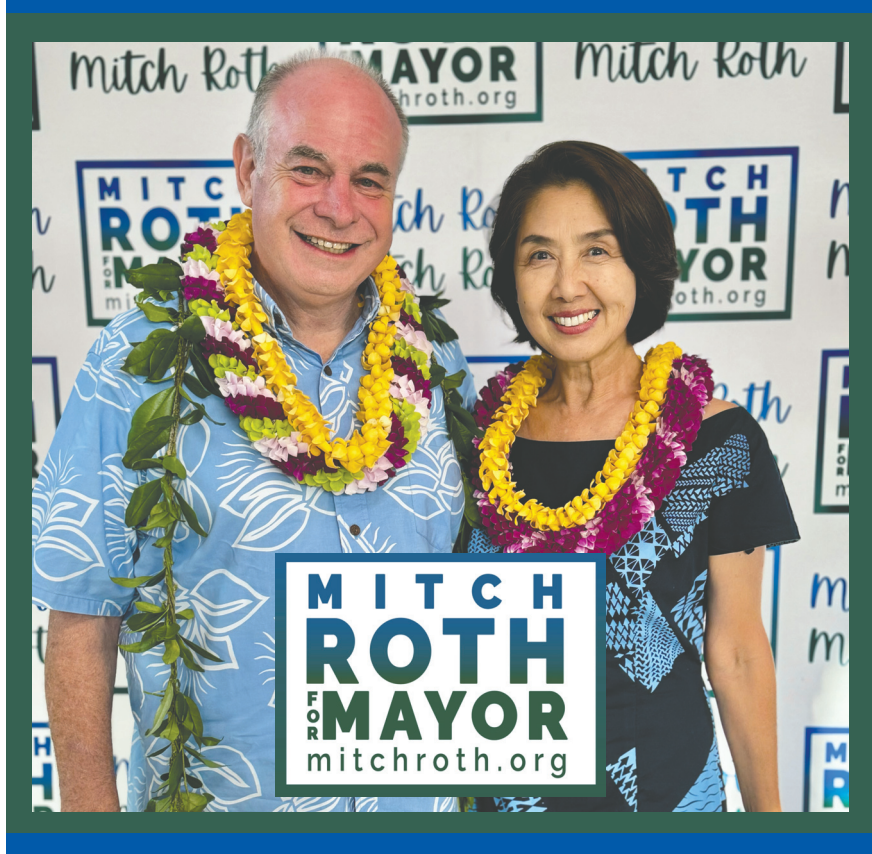
PAID FOR BY FRIENDS OF MITCH ROTH , PO BOX 1635 HILO, HAWAII 96721

With your continued support, we will make Hawai'i Island a better place to live and thrive!